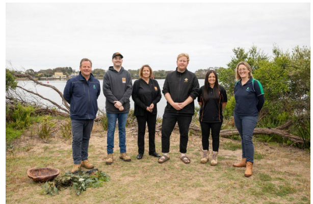
Wadawurrung representatives and Barwon Coast staff at Bukareeyoo.