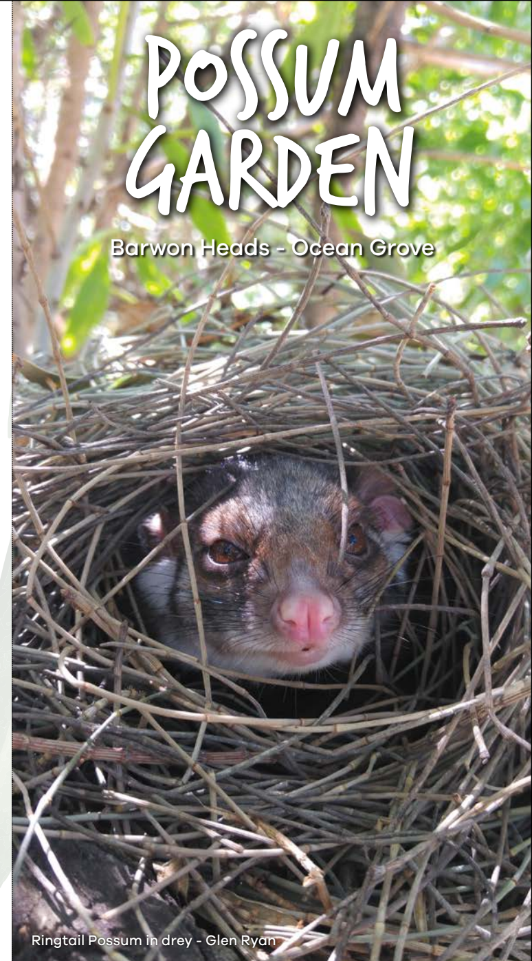
Ringtail Possum in drey - Glen Ryan

Possums can live for 15 years. Possums are protected wildlife and are losing their homes.