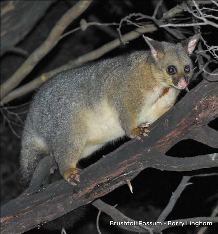
Brushtail Possum - Barry Lingham

The red mark on the chest of the Brushtail Possum is its scent gland, used to mark its territory.